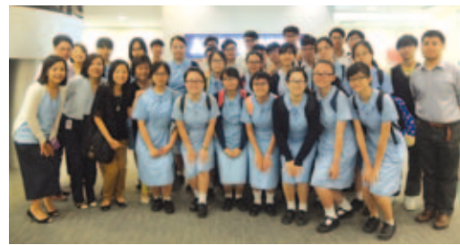
Students Visit ASL Hong Kong Headquarters 學生參觀ASL香港總部