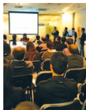
Technology Briefing To Employees 員工IT知識分享會