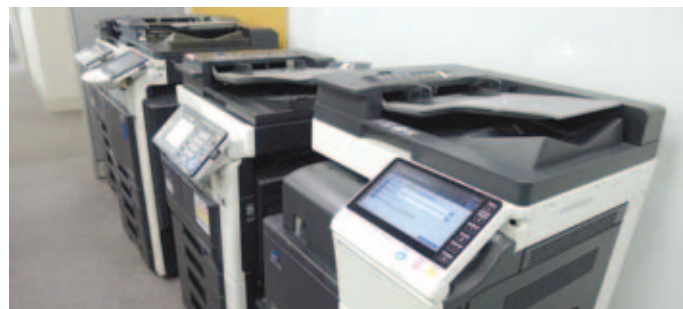
Cloud Printing Project 雲端打印項目