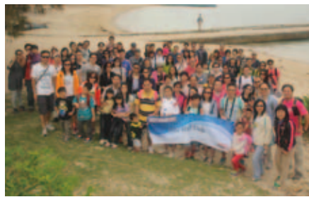
Day Tour to Hong Kong Geopark 香港地質公園一天遊