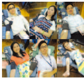
Blood Donation Day 愛心捐血日