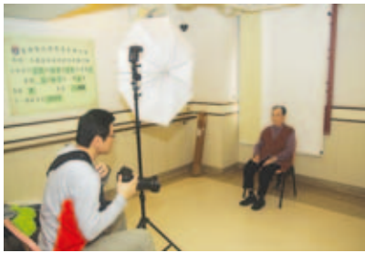
Photo Taking for Elderly 為長者拍照