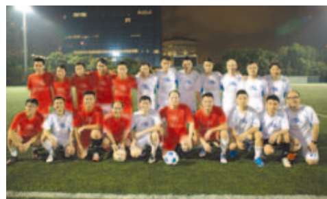
ASL Football Team ASL 足球隊