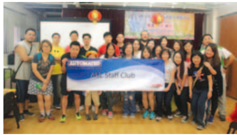
Mid-Autumn Festival Elderly Center Visit 中秋節長者探訪