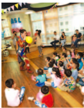
Kids Day 親子日