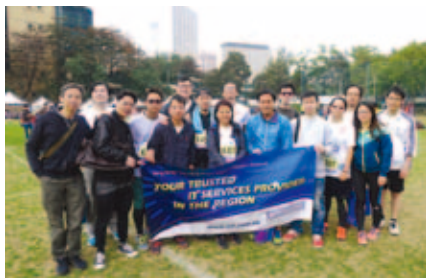
SME Marathon Cup 中小企馬拉松盃