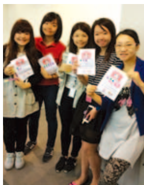
Friendship Day 友誼日