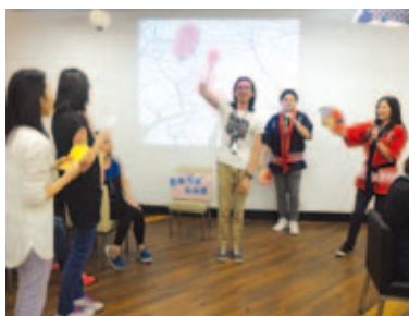
Staff Drinks Night 員工暢飲之夜